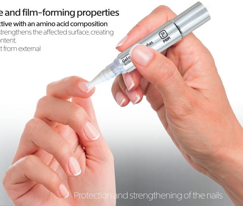
Protection and strengthening of the nails

The formula also contains a powerful bioactive with an amino acid composition similar to keratin. This bioactive repairs and strengthens the affected surface, creating a hygroscopic film that increases moisture content. Its proteins act on the nail surface, protecting it from external aggressions and adding elasticity.